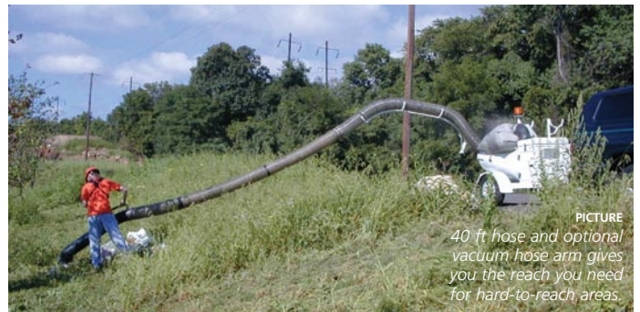
PICTURE 40 ft hose and optional vacuum hose arm gives you the reach you need for hard-to-reach areas.

One Madvac 61 does the job of 4 to 5 manual pickers. Our machines have made the old-fashioned manual litter collection methods a thing of the past. The 61 can do the job of a vanload of people. It's there, when you want it... and it's always productive.